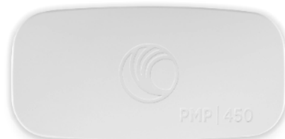
Mid-Gain 17 dBi