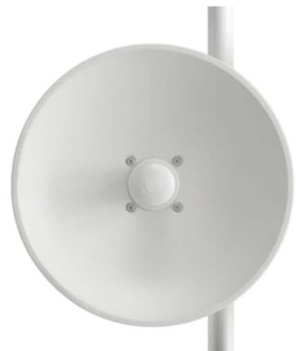
High-Gain 24 dBi