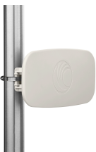
ePMP Force 180